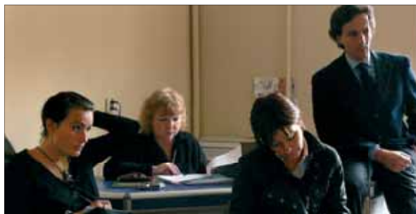
Crescendo in the social cooperative, WWWpromotion, Wroclaw

The Italian partnership visited some Polish social cooperatives located in different towns (Poznan, Wroclaw, and Walbrzych) and so could get the idea of the local social economy situation in the Lower Silesia Region.