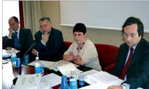
Study visit in the administration of the Regione Liguria, Genoa

It was decided to hold the final event of the project in October 2007 in Wroclaw (capital of Lower Silesia Region) to bring attention to the social economy sector in the region and develop future collaboration between different institutions and enterprises of both regions. Representatives of regional authorities, institutions and social enterprises of both Regions, being in charge of agricultural issues, labour policy, transnational cooperation and activities of Chambers of Commerce were involved.