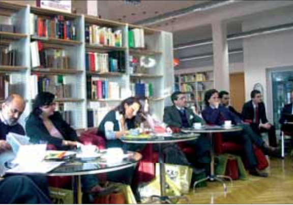
Final event, meeting in the library of Lower Silesia, Wrocław Finalowe przedsięwzięcie w bibliotece Dolnośląskiej, Wrocław

władz regionalnych i jednostek samorządowych z różnych branż – rolnictwa, polityki zatrudnienia, współpracy międzynarodowej, izb handlowych oraz i spółdzielni socjalnych; ■ wydanie publikacji o wspólnych doświadczeniach w kontekście ekonomii społecznej w języku angielskim, ze streszczeniem po polsku oraz włosku.