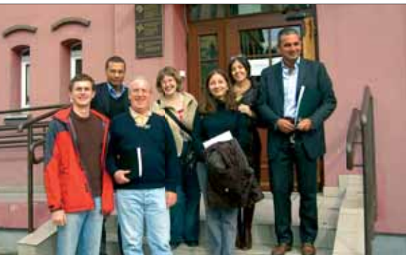
Transnational meeting in Foundation "Merkury", Walbrzych

This Law is the latest regulation, introduced in 2003. The new law addresses a number of key issues: including a new legal status for NGOs carrying out public benefit activities, incentives to encourage public philanthropy,