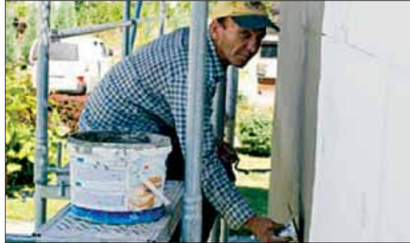
Social cooperative in Byczyna: construction and repairs

The history of changes has started in 2001, when Byczyna Social Assistance Center designed the program "Self-Dependence." Then the Law on Social Employment passed in 2003 provided the administration with other opportunities and in 2004 they opened Community Integration Center "CISPOL." The Center created individual programs of social employment with additional education in writing, reading and speaking, personal manners, paper work as well as with vocational trainings for builder, gardener, carpenter and mechanic. In the first group of 34 participants, 15 people were chosen to establish a social enterprise for service, trade and production.