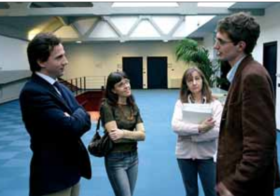
Transnational meeting in Sviluppo Italia Liguria, Genoa