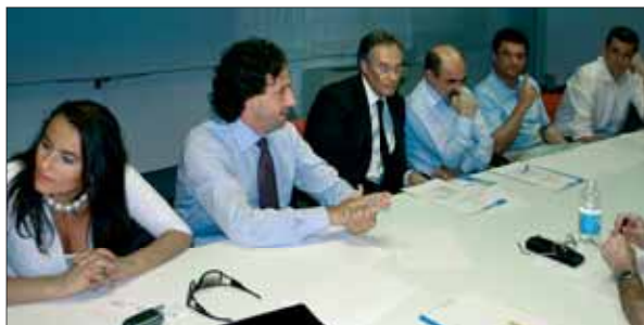
Transnational meeting in Sviluppo Italia Liguria, Genoa