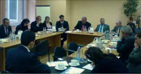
Transnational final event in the Chamber of Commerce of Lower Silesia, Wrocław

The objectives were implemented through: