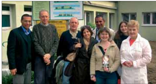
Crescendo in the hospice named after Jan Paweł II, Walbrzych

NGOs pay too little attention to economization of own activities, mostly because of non-for-profit goals – on the one hand, and lack of concern and competences in financial management – on the other hand. Those organizations that managed to prepare and establish administrative and financial resources for funds from EU (which are incredibly huge comparing to previously available funds for NGOs) are now at risk of losing non-profit and social character. They rarely involve vo-