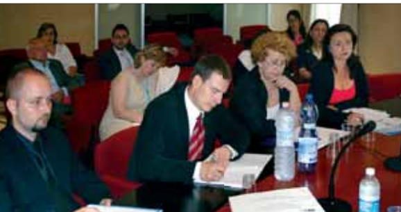
Study visit in the administration of the Regione Liguria, Genoa

During the study visit of Italian partners in Lower Silesia, a workshop was organized on the following topics: the new European programs for Poland (2007-2013), managing tools of local Regional Development Program and all specific measures regarding social and transnational cooperation for Polish institutions and enterprises.