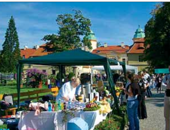
Catering on the event in the castle "Ksiaz" by the social cooperative "The Gardens of Tastes", Walbrzych

The Board consists of 2 people: the Chairman and Deputy. Represent the cooperative and rule everyday, prepare annual activity plans, annual narrative and financial reports and submit them to the General Meeting of all members. General Meeting of all cooperative members makes important decisions (purchase of equipment, accepting new members and annual activity plans, etc.).