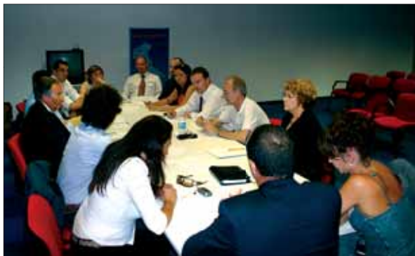
Transnational meeting in Sviluppo Italia Liguria, Genoa

Each final enterprise is besides entrusted to the tutoring of a social cooperative or, in some cases, of a consortium of social cooperatives that shall have a minimum