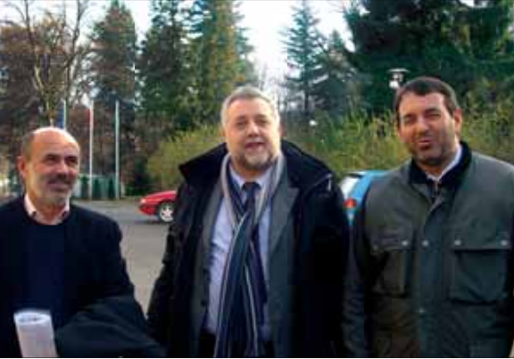
Final event, meeting with the Chamber of Agriculture in Sobotka, Wrocław