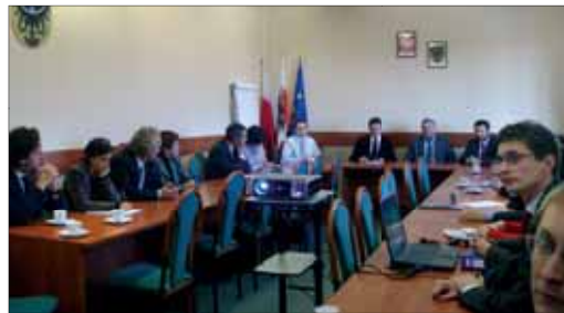
Final event in the administration of Lower Silesia, Wroclaw

To conclude 2-year cooperation we issued the handbook containing best practices of social cooperatives in Liguria and Lower Silesia, legal framework on social cooperation of both countries, as well as a summary of all the activities implemented in the transnational project. The handbook is in English with short descriptions in the Polish and Italian languages.