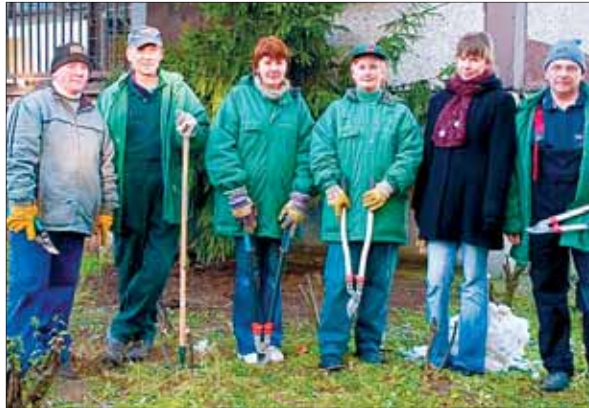
Social cooperative "The Secret Garden", Poznan

Poznan's "bedroom suburbs" Piatkowo has about 50.000 residents and Winogrody – 60.000 people. Parts of residents are long-term unemployed, aged and live alone,