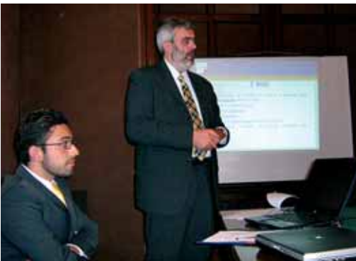
Transnational meeting in FILSE, Genoa