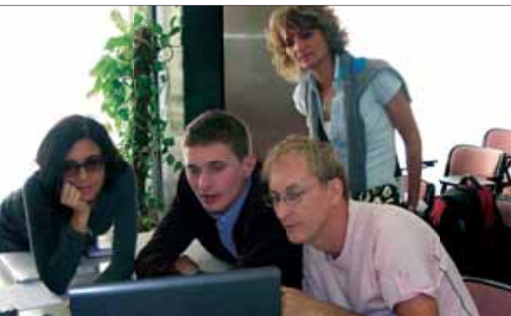
Transnational meeting in the Chamber of Commerce, Sanremo