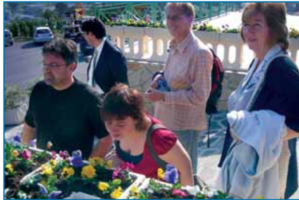
Mulion in "Il Cammino", Sanremo

The cooperatives participate in the Regional Consortium of B-type social cooperatives named "Progetto Liguria Lavoro"; its participation has been until now more formal than substantial, without any operative benefits.