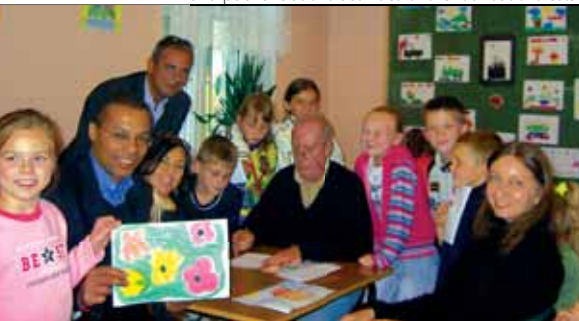
Crescendo in children community center, Walbrzych

When evaluating development of the non-governmental sector since 1989, we see a lot of successes and challenges in different spheres when dealing with professionalism, standards and ethics of activities, as well as when building relations with public and business sectors. In the sphere of professionalism NGOs constantly improve qualifications of specialists engaged in activities and management competences, which is also tightly related to requirements for project applications for EU Funds. As for the sphere of relations with public administration, the main success was the joint work over the Law on public profit organizations and volunteer activity. Consequently, it obliged local authorities to prepare annual plans on cooperation with NGOs. The process of uniting organizations into federations on national and regional levels also contributed to relations with governmental structures. Federations work on and then present their joint position and opinions. For example, during consultations on the new period of EU funds programming, NGOs actively participated together with government representatives. The sphere of cooperation between non-profit and bu-