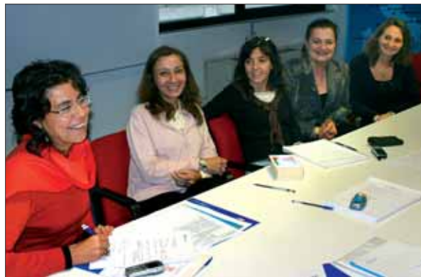
Transnational meeting in Sviluppo Italia Liguria, Genoa