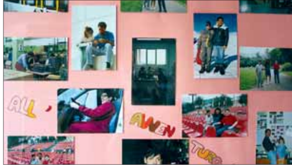
Social cooperative "L'Altro Sole", Genoa